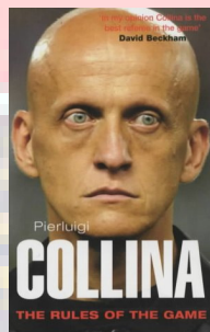
"The Rules of the Game" by Pierluigi Collina