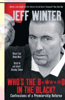
"Who's the B****d in the Black?" by Jeff Winter